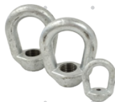
FIGURE 290 Weldless Eye Nut Size Range: 3/8" - 2-1/2"