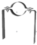
FIGURE 100 Extended Pipe Clamp Size Range: 1/2" - 8"